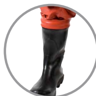
Sewn-in socks in the suit material or attached boots