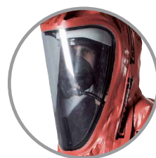
CV wide vision visor with 3D depth of 20 cm, giving extra side view. Alternatively large VP1 visor.