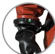
Bayonet glove ring system for quick and simple glove exchange