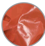
Strong and flexible suit material which offers maximum protection against aggressive chemicals in all forms