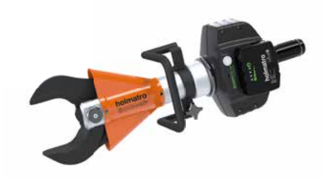
BCU 10 A 20