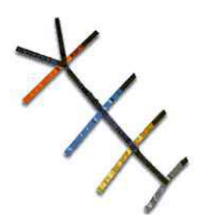
Above: T-Straps wit colour coded straps To the left: B-BAK Orange